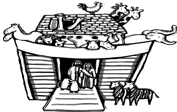
Noah's Ark News

Although there is still snow on the ground and we have missed a few days of school due to the weather, Noah's Ark students and teachers are looking forward to our warmer weather activities that will be approaching in the next couple of months.